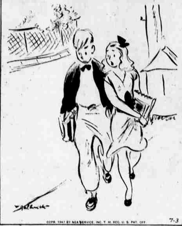
"My father, was on a radio quiz program, and now he thinks nobody can get enough knowledge—that's why I'm in summer school!"