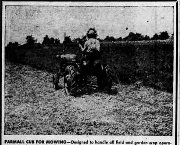
FARMALL CUB FOR MOWING —Designed to handle all field and garden crop operations, the all-purpose tractor shown above is the new Farmall Cub with a Cub-22 mower cutting a 4½-foot swath of alfalfa.