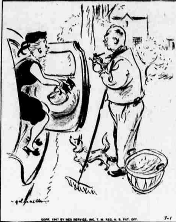
"I got a compliment for you at the bridge club—one of the girls said you were as handsome as the men in the whisky ads!"