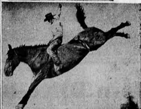
AL McNEIL ON "GLASSEYE" From sketch by Newt Nelson.

More than 300 different cow brands are shown here. You will find many more displayed in our show windows.