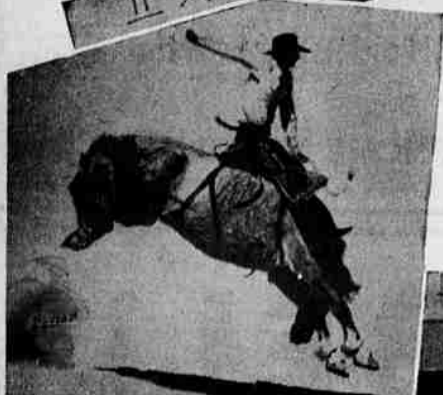
JACK SHERMAN ON "11:35" AT PORTLAND 1943 From sketch by Newt Nelson.