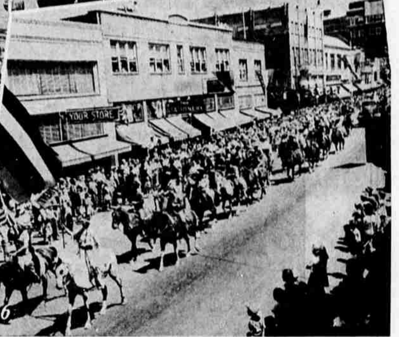
PARADES DATE BACK to the first victorious warriors returning from battle. They've come down through the years until floats, bands, marching units, prancing horses and their riders, are synonymous with the word—parade. Centering this layout of parade pictures is one taken just exactly 40 years ago this Fourth of July and showing a horse-drawn float which probably carried the queen of the 1907 celebration. Note the dirt street and the long stream of riders as they proceed down Main street near the Link river bridge. Old timers will recognize many names painted over the store fronts. This picture is from the Maude Baldwin collection. No. 1—Marines stationed at the Barracks during war years were prominent in every parade held during the period the big plant on the hill was a thriving community made up of Pacific veterans of the United States marine corps. No. 2—1907 parade. No. 3—Crowds jam Main street sidewalks as riders pass by wearing typical Western garb during last year's big Fourth of July parade. No. 4—More marines led by their commanding officers on horseback. No. 5—Klamath's parades become more elaborate as surrounding communities enter decked floats. This is last year's Centennial parade. No. 6—Another group of riders which contribute a great deal of that necessary Western tang to a rodeo parade, a tradition in the Klamath country. This year's Big Parade is slated for Friday morning at 10 o'clock, July the Fourth, down Main street. (Pictures 1 and 2, official U. S. marines corps photos; No. 2, Baldwin; others by Wes Guderian, Herald-News).