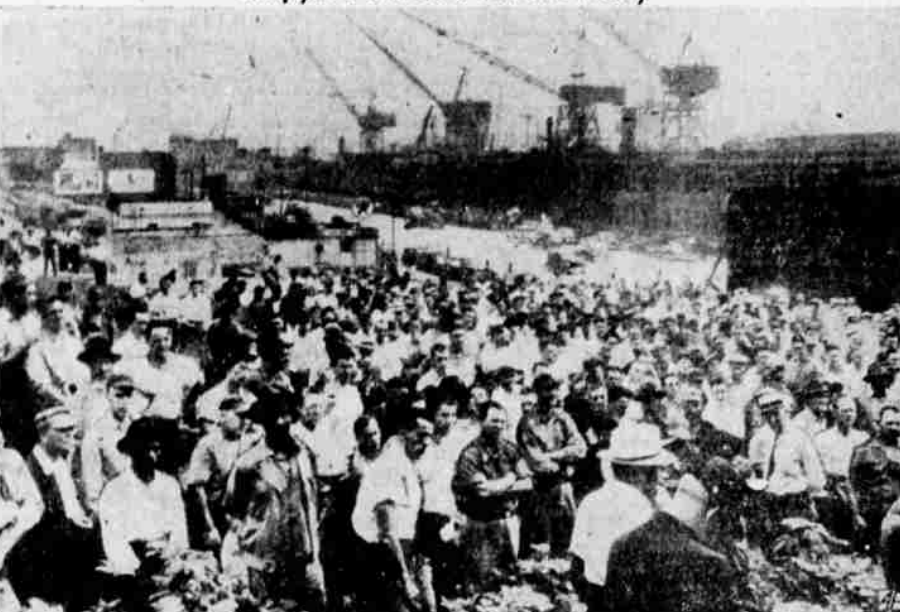
Part of 8000 CIO workers who went on strike at three Bethlehem shipbuilding plants, gather at the Key Highway yards at Baltimore to listen to a speech by a union leader. Pickets with signs march in background.