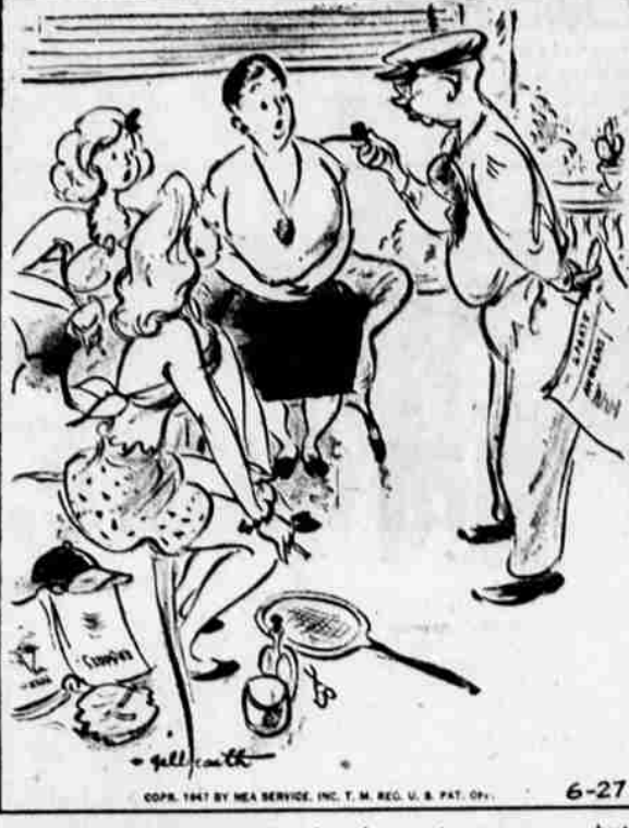
"All right, we'll go to that beach resort once more—but if you don't catch husbands this time, we're going to a place where I can fish next year!"