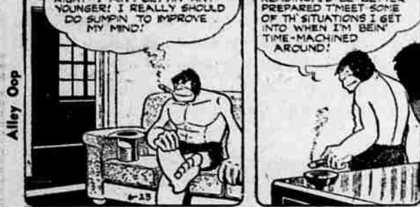
YKNOH, OL' DOC WONG'S RIGHT—I AIN'T GETTIN ANY YOUNGER! I REALLY SHOULD DO SOMETHIN TO IMPROVE MY MIND!