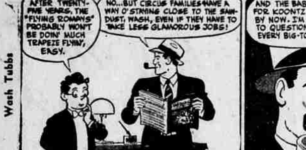
LESSEE NOW, THAT BOOK LOOKS LIKE IT MIGHT BE INTERESTIN'!