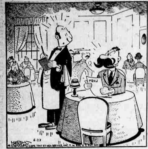
"You heard me—no soup!"