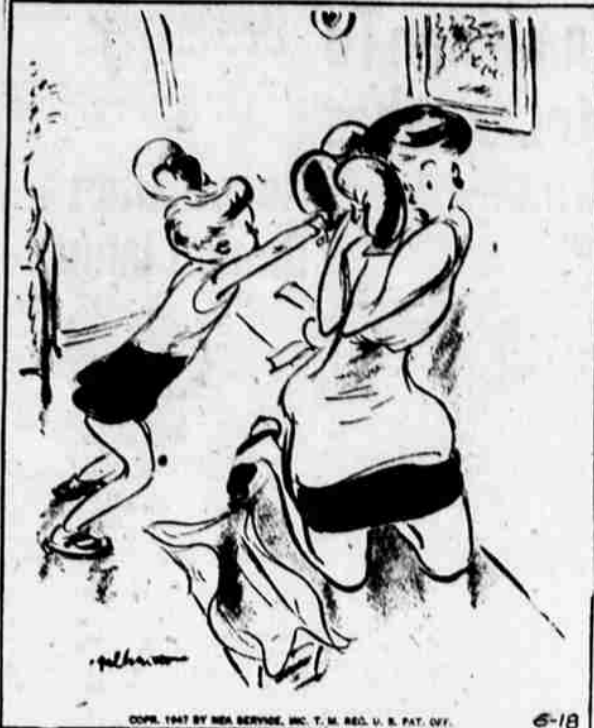
"The next time your father buys you a birthday present, I'm going to help him pick it out!"