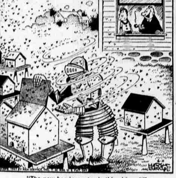
"The new bee inspector is thin-skinned!"