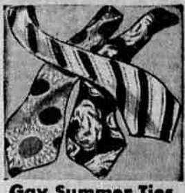
Gay Summer Ties 98c and 1.49

Low Price! A real value! Good quality cotton sock, economy priced and guaranteed by mfg. Reinforced heels, toes. Regular length. 10 to 12.