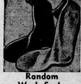
Random Work Socks 29c

Top values for rugged wear. 8-oz. sanforized denim, copper riveted at strain points. 6 pockets. Blue. Waist 28 to 42. Inseams 30 to 36.