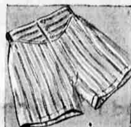
Broadcloth Shorts 3-Snap Front 79c

Easy Terms ON PURCHASES TOTALING $10 OR MORE