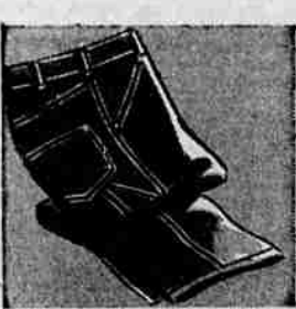
Bandtop Overalls "Double Duty" 2.29

Top grain side cowhide leather on palm and continuous thumb; side split cowhide back. Gunn cut for extra wear. Gauntlet or band top.