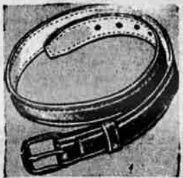
Men's Dress Belts All Leather 98c

Heavyweight broadcloth pajamas. Blazer stripe patterns in assorted colors. Notch collar coat style. Drawstring waistband.