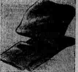
Covert Work Pants 2.39

Hercules Styled Gives comfortable long wear. Sanforized suntan cotton cut roomy over graduated patterns. Dress style collar. Sizes 14 1/2 to 17.