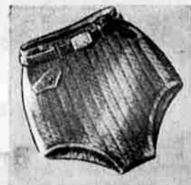
Men's Swim Trunks Pillarim Value 2.98

Quality men's shorts at Sears low prices. Pre-shrunk cotton broadcloth in many colorful patterns. 3-snaps. Elastic sides. Sizes 30-44.