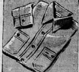
Suntan Work Shirt 2.88

You'll find just the tie you're looking for in this fine assortment. Wide choice of attractive patterns and fabrics in rich colors.