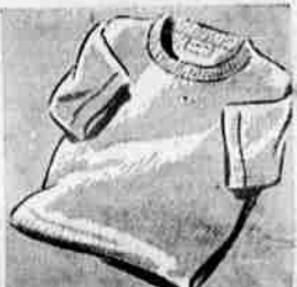
Pilgrim Tee Shirts For Men 79c

100% Zephyr wool worsted swim trunks with a smart Jacquard novelty stitch. Built-in knit supporter. Royal, maroon, maize, 30 to 40.