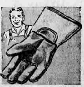
Men's Work Gloves Were 1.79 Now 1.27

Top grain side cowhide leather on palm and continuous thumb; side split cowhide back. Gunn cut for extra wear. Gauntlet or band top.