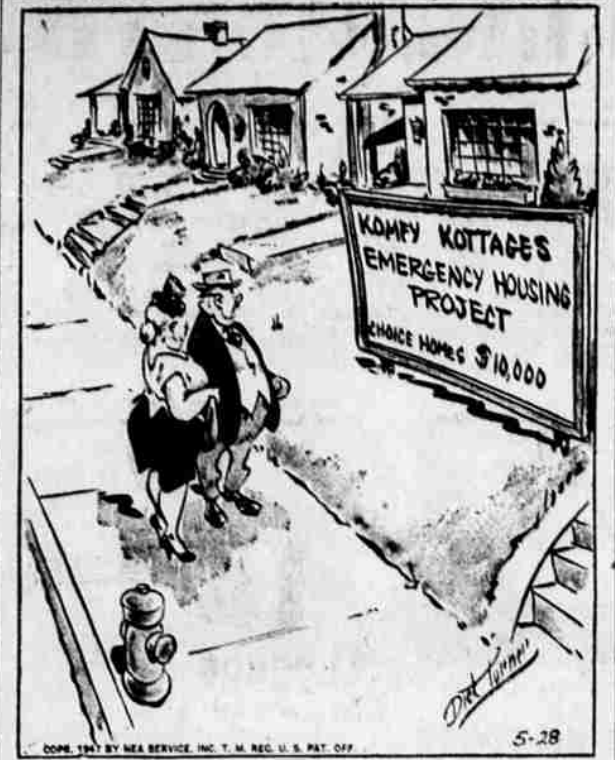
"Ten thousand bucks! Those emergency are they thinking about—ours or theirs?"