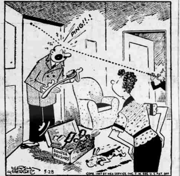
"And now may I suggest an extra long-handled one?"