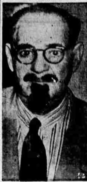
Dr. Leonardo Arguello (above) is the president of Nicaragua where the army took over the government. He was elected last February and installed May 1.