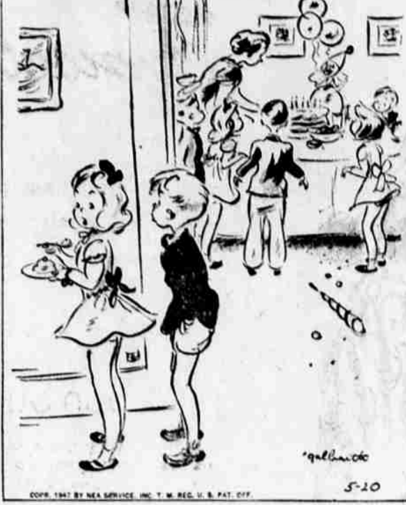
"I'd rather you didn't ask me for several years yet—I don't believe in long engagements!"