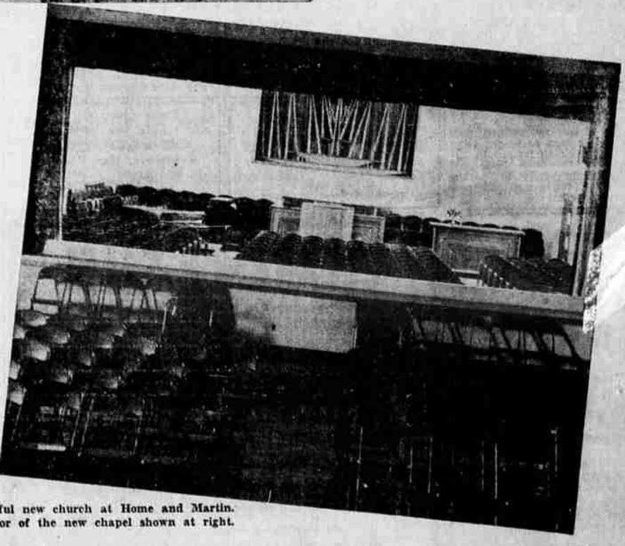
Top view shows exterior of the beautiful new church at Home and Martin. Left is the Baptismal Font with interior of the new chapel shown at right.

1 P. M. to 6 P. M. Saturday—Building open for Public Inspection — Guides in attendance.