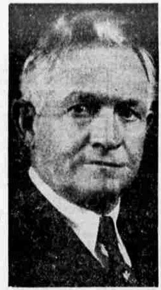
Elder David O. McKay, of the First Presidency of the Church