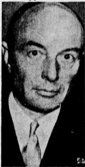
President Truman has appointed Robert A. Lovett (above), New York banker and former assistant secretary of war to replace Dean Acheson as undersecretary of state. Acheson has resigned and Lovett takes over his new post on June 20.