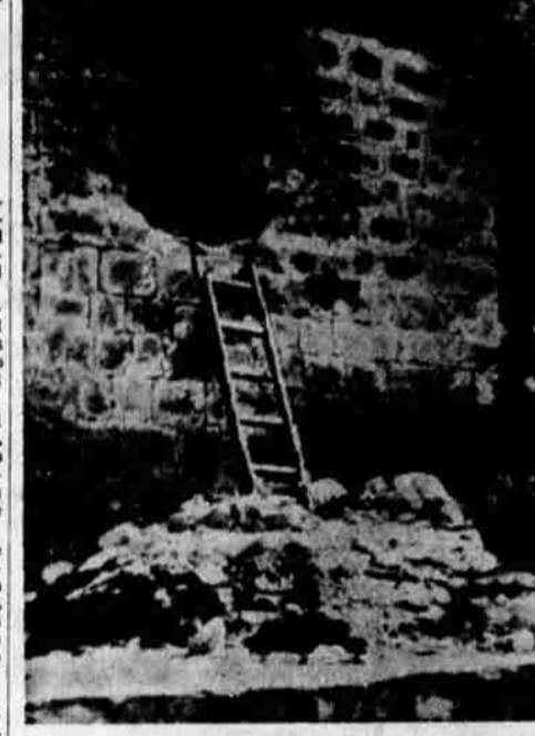
Two men look over debris beneath shattered windows of ancient Acre prison, north of Haifa, which was blasted by explosions set off by members of an underground band. Sixteen persons were killed during the attack and more than 150 prisoners were reported still at large.