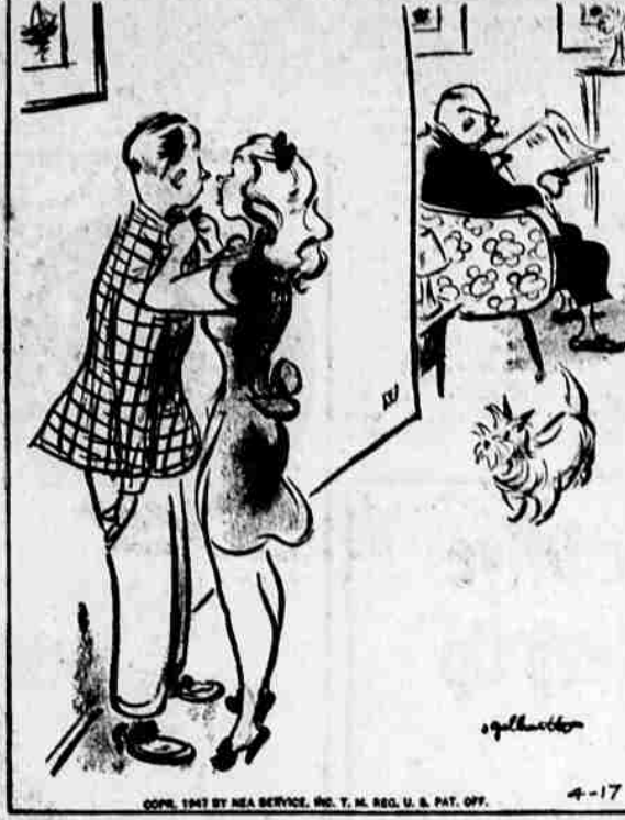
"Dad always says I'm the biggest expense he's got, so why not just tell him you'd like to take a big financial problem off his mind?"