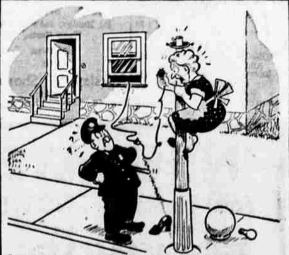
"BUT OFFICER--WE JUST HAVEN'T ENOUGH OUTLETS IN THE HOUSE!"

PORTLAND, April 14 (AP)—Unemployment in the metropolitan Portland area dropped 2100 last month to a total 23,500, the state employment service reported today.