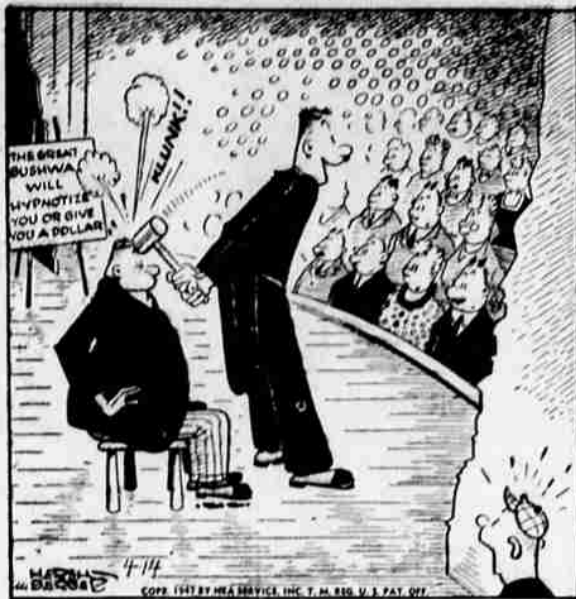
"And now as I turn, the subject will be hypnotized!"