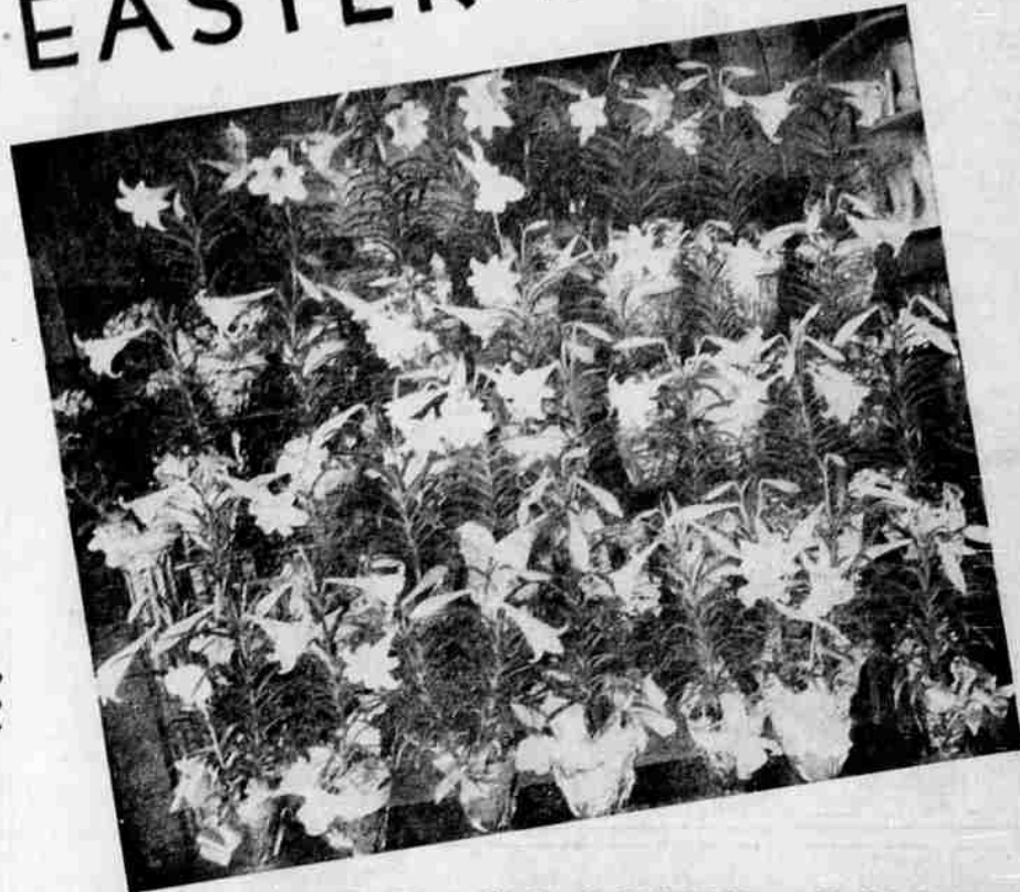
Here are a few of the early ones just coming into bloom . . . grown locally by

Order NOW Oregon's Famous Croft EASTER LILIES