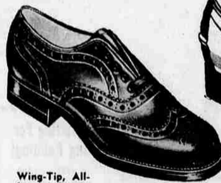
Wing-Tip, All-Leather For Boys