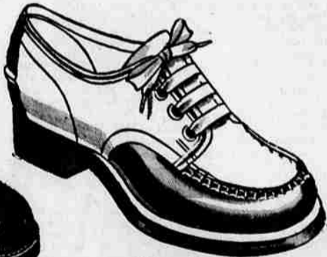
2-Tone Non-Marking Sole. Sizes 8½ to 4.