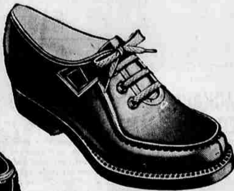
Moccasin Toe Oxford For Women & Children