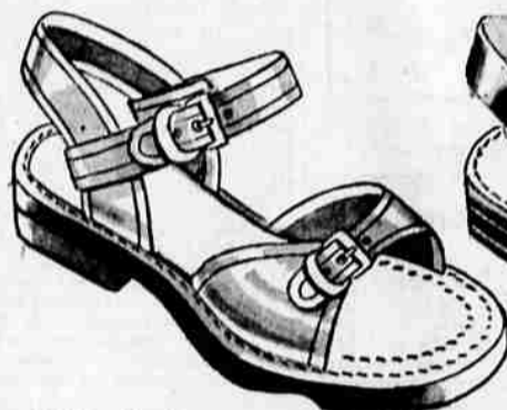
White Plastic Sandal. Size 4 to 3.

Knit of fine quality 100% French spun zephyr wool that's as soft as kitten's fur. Popular V-neck style. Smooth fitting ribbed waistband and cuffs. 5-button front. Your choice of white, black, gray, lush pink, aqua. Sizes 34 to 40.