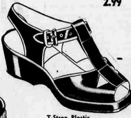
T-Strap Plastic. Narrow & Med. Widths