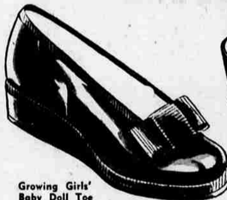
Growing Girls' Baby Doll Toe