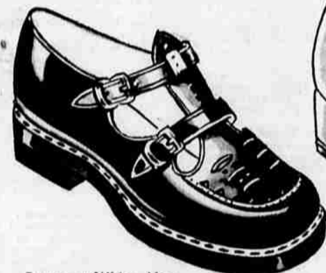
Brown or White, Non-Marking Sole and Heel