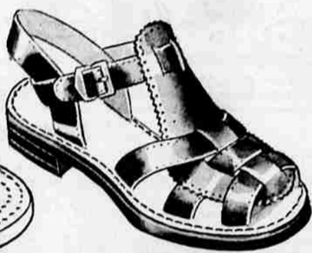
Barefoot Sandal. Size 9 to 3