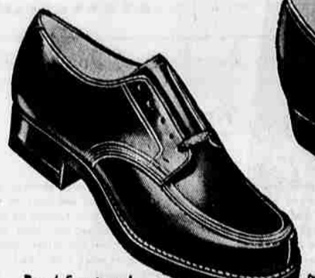
Boys' Sport and Dress Shoe