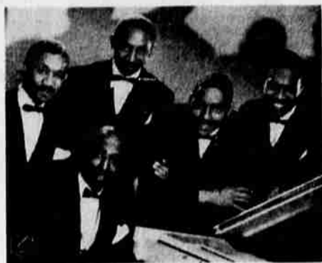
Currently Appearing at Lakeshore Inn