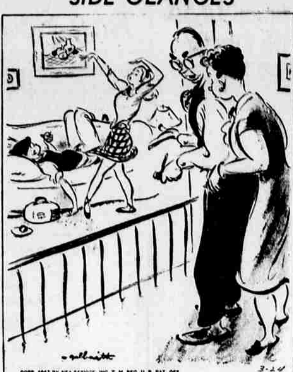
"If the ballet slippers influenced her so much, maybe we should try getting him a pair of work shoes!"