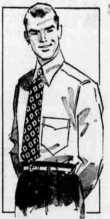
NEW SHIPMENT! Brent White Shirts

Fine count white broad-cloth shirts that are nationally known for wearability. Sanforized shrunk . . . all sizes for men.