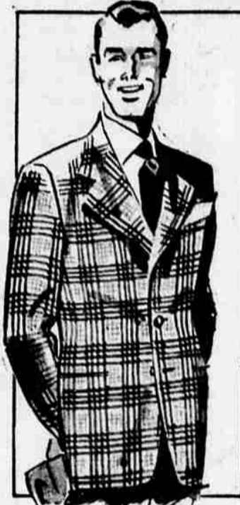
WOOL SPORTS COATS

REDUCED! A man's choice for casual and sports wear! Smartly tailored, 3-button single-breasted models in all wool fabrics. Sizes from 34 to 44.