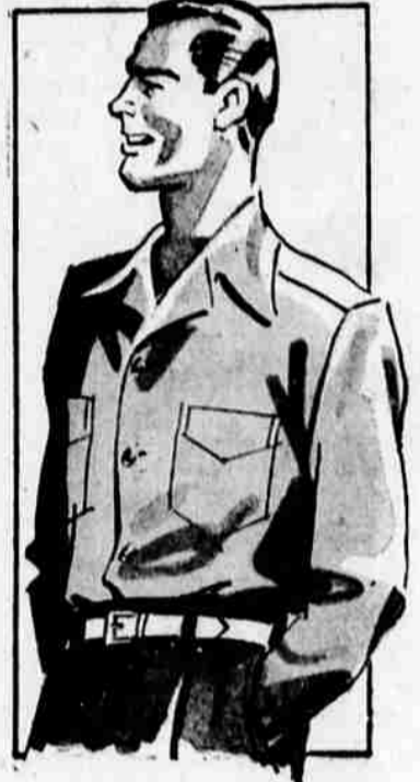
SMART SPORT SHIRTS

REDUCED! Styled for casual comfort! 50% rayon, 50% cotton shirts with long-sleeves, 2-way collars. Maize, blue, natural, tan. S-M-L.