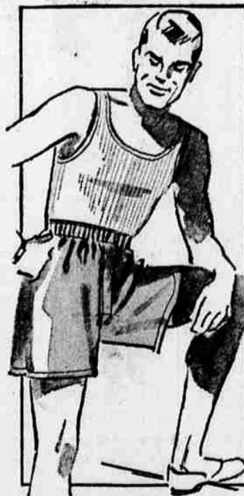
SHORTS AND SHIRTS

Budget-priced—and what a buy! Handsome 'all wool tweeds in herringbone and diagonal patterns. They're casually styled suits with three-button, single-breasted coats and pleated trousers. Newest Spring shades. Sizes 34 to 42. Slacks are gabardine in wool and rayon mixtures.