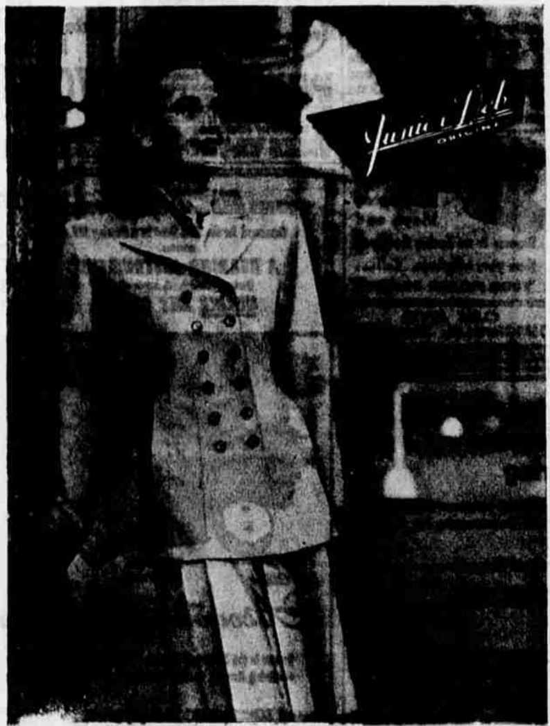
As featured in Junior Bazaar

Wonderful all-wool gabardine tailored into this beautiful, fashion-right long jacket classic by Junior-Deb . . . adapted from a Parisian Original. The smartly pleated skirt heralds a new era in fashion . . . For you it's the suit of the year. In junior sizes.