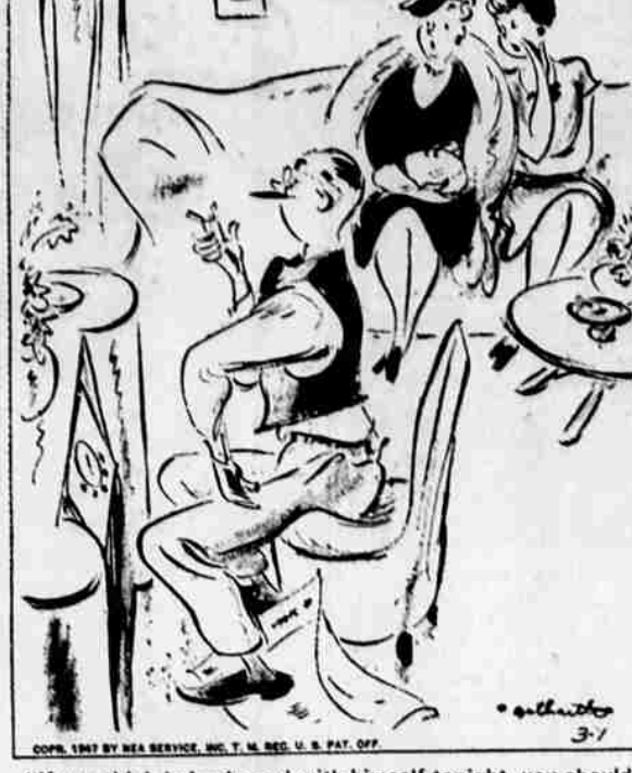
"If you think he's pleased with himself tonight, you should see him on the nights when he answers all the questions ahead of the contestants!"