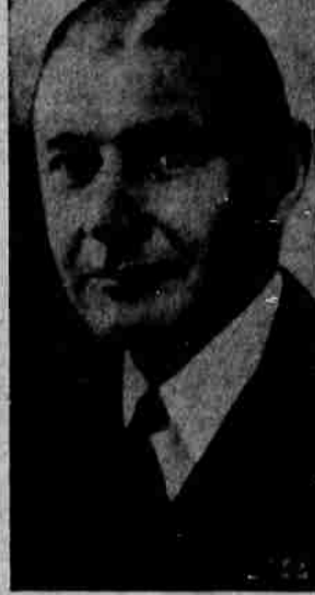
Lewis W. Douglas (above), one-time budget director, was appointed by President Truman to be ambassador to Great Britain and his nomination sent to the senate.