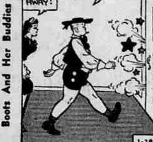
Boots and Her Buddies