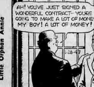
Little Orphan Annie