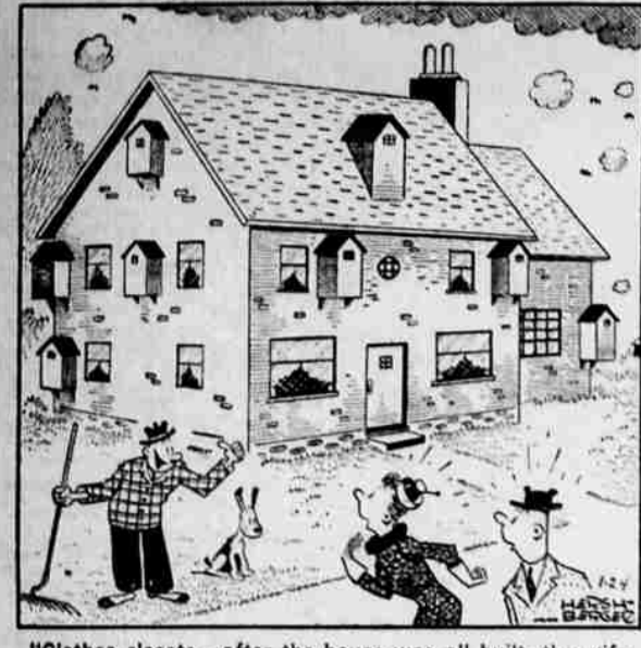
"Clothes closets—after the house was all built, the wife decided she needed more of them!"

By HAL BOYLE NEW YORK, Jan. 24 (AP)—Two of the most interesting people in the world today are Bob Casey, one of those rare characters who become a legend in their own lifetime.