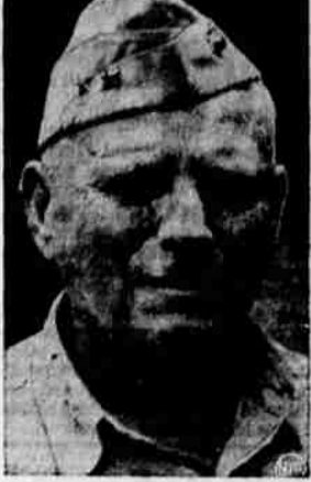
LT. GEN. ROY S. GEIGER