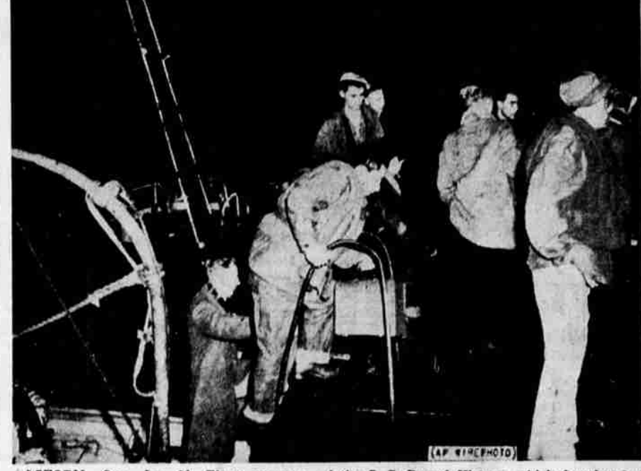
ASTORIA, Ore., Jan. 21—These crewmen of the S. S. Drexel Victory, which foundered off Cape Disappointment last night, climb to the Astoria pier after their rescue by the pilot schooner Columbia. No lives were lost when the ship, loaded with grain and bound for Japan, went down early this morning.