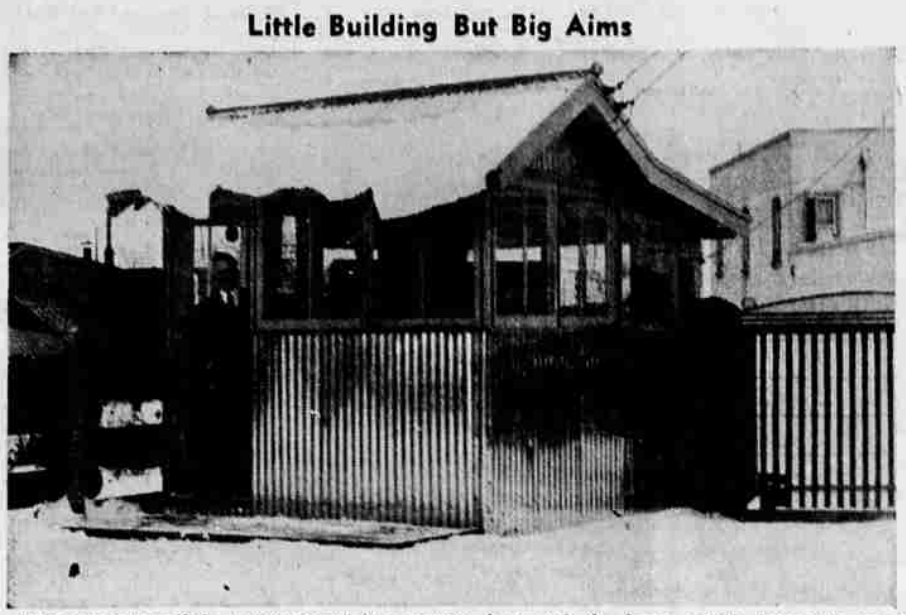
"Big oaks from little acorns grow" is a proven fact, and the local YMCA hopes to do as much, despite its small beginnings now. Pictured above is Cecil Kollenborn, standing in the doorway of the 8 by 10 office now serving as headquarters for the "Y." The office was furnished through the courtesy of the Balsiger Motor company until such time as larger quarters may be found. The building is located on the Balsiger used car lot, at the corner of Main and Esplanade.