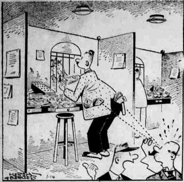
"He claims he's crowded for space!"