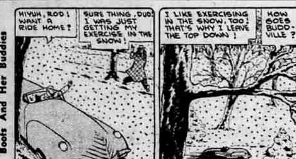
Boots and Her Buddies