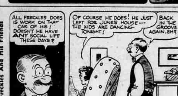
Freckles And His Friends