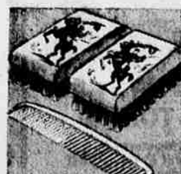
Brush, Comb Set Excellent Boys' Gift 1.00 With a brush and comb set of his own, he'll take pride in keeping his hair sleek. Set has strong comb and 2 wood back brushes.