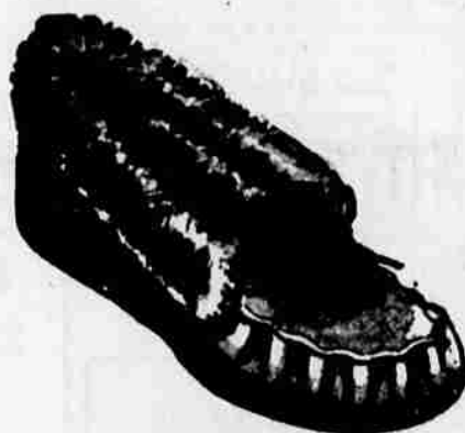
Moccasin Slippers Soft crushed leather uppers warmly lined with natural sheepwool. Semi-hard soles. Men's sizes 6 to 12. 3.69