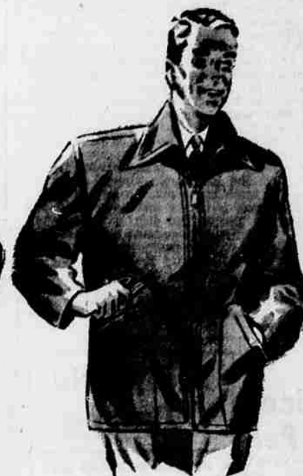
Lightweight Poplin Knockabout Jacket 5.79

Profession in any weather for the hunter and sportsman. Genuine stag model, tailored of 100% wool. Raglan shoulders, large utility pockets and game pocket. Sizes 34 to 46.