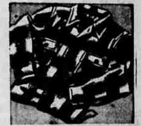
Boy's "Jacket Shirts" Beautiful Checks 6.98 100% virgin wool "jacket shirt." Has long, fuzzy fibers for extra warmth. In or outer style, in red and black or black and white checks. 10-20.