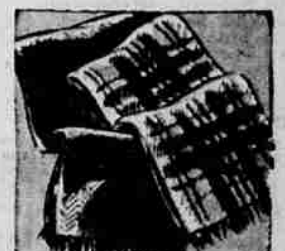
Dressy Mufflers Choice 1.50 100% wool in fancy or solid colors. You're bound to find just the muffer to please you in this fine selection.