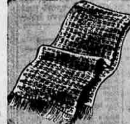
Wool Muffler For Boys 1.10 Soft, warm all wool (see label for wool content) Boysville muffler. In wide choice of colorful, attractive plaids. 12x48-inch size.