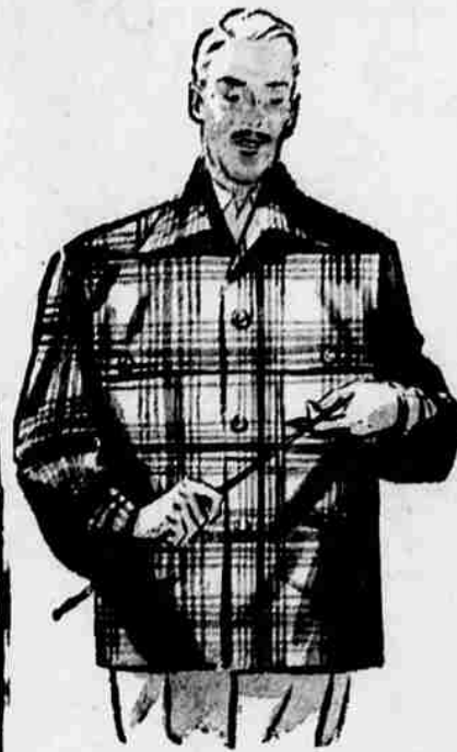
Cruiser Model for Your Outdoor Man 13.95

SANTA CLAUS Interviews children at Sears every afternoon, 3:30 to 4:00. (Broadcast over KFJI). Saturday from 1:30 to 5:30.