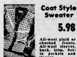
Coat Style Sweater 5.98 All-wool plaid or checked fronts. All-wool sleeves, back, trim. Set-in pockets and sleeves.