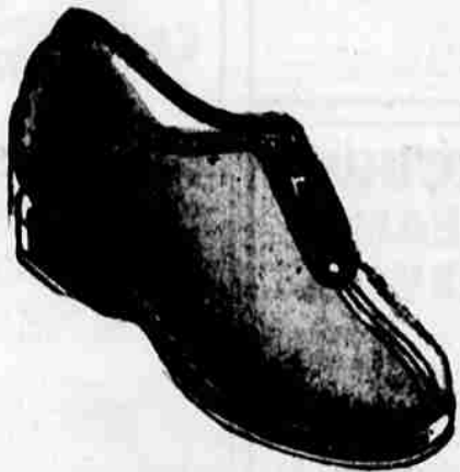
Men's Zipper Boots Thick camel-like fabric uppers with padded leather soles. Sizes 6 to 12. Dad's Christmas gift. 2.98