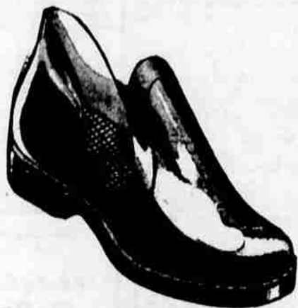
Men's Soft Romeos Gifts for lounging! Black kid leather uppers assure solid comfort. Sizes 6 to 11. 3.49

MORE Slippers ... BETTER Slippers, at Sears-and You Save up to 1.00 Pair!