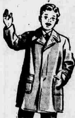
Boyville Jr. Tan Twill Raincoat Zeilan Plaid Lined 4.98

Rain won't keep Junior indoors. Not when he's the proud wearer of this fine raincoat. Made of good strong twill that's impregnable treated, making it water-proof. Lined with zeilan plaid. Two flap pockets. Even sizes 4 to 10.