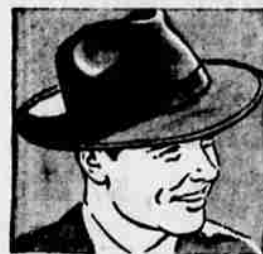
Pilgrim Felt Hats Streamlined 5.98 Soft fur felt that's light on the head. One piece construction, narrow ribbon, medium wide brim. Takes and holds any shape. Gray, brown, or blue. All sizes.

It's that famous 26-inch model with three roomy pockets. A man couldn't ask for a finer jacket. Lots of downright good service, plus good looks. Fully lined. Men's sizes.