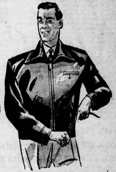
Cossack Style of Genuine Leather 15.98

Work, sport or knockabout, he will take to this blouse-jacket. Water-repellent with three pockets. Zipper front. Very warm, too. Sizes 34 to 46.