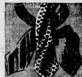
Attractive Neckties Smart Patterns 98c to 1.50 Ties that are preferred by good dressers. Soft rayon that knots easily, drapes smoothly. Smart woven patterns. Assorted colors.