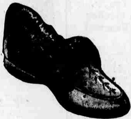
Canadian Mocs All leather moccasin slippers trimmed with fur and beads. Blue, red, or brown. Sizes 4 to 9. 3.50