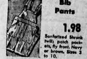
Bib Pants 1.98 Sanforized shrunk twill patch pockets, fly front. Navy or brown. Sizes 3 to 10.