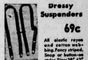
Dressy Suspenders 69c All elastic rayon and cotton webbing. Fancy striped, soap or button-on styles. Sizes 38", 42"