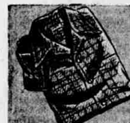
Men's Sport Shirts Pilgrim Quality 8.95 Warm, comfortable sport shirts in 100% wool and colors to choose from. Long sleeve style. Two handy pockets. All sizes.