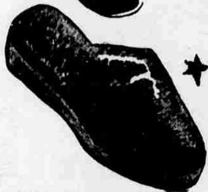
Women's Warm Scuffs Mechtrified shearing uppers with solid leather soles. Warm and handsome Christmas gifts. Sizes 4 to 9. 2.98