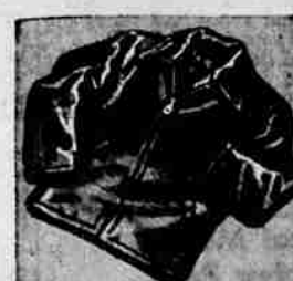
Boys' Leather Jacket Boysville Jr. 13.95 Soft, pliable capeskin leather that will wear and wear. Full zipper front. Lined with cotton plaid flannel. Tan. Even sizes 4 to 8.

Rain won't keep Junior indoors. Not when he's the proud wearer of this fine raincoat. Made of good strong twill that's impregnable treated, making it water-proof. Lined with zeilan plaid. Two flap pockets. Even sizes 4 to 10.