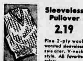
Sleeveless Pullover 2.19 Fine 2-ply wool worsted sleeveless sweater. V-neck style. All favorite colors.