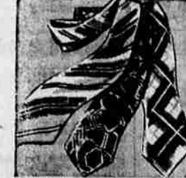
Handsome Knit Ties Boysville 49c to 1.00 Colorful four-in-hand ties. Wide assortment of stripes, plaids and all-over prints. Well made. Just right for young boys.