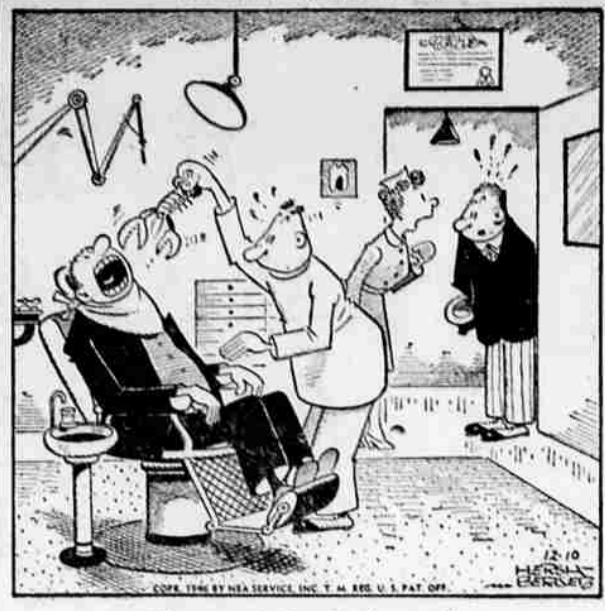
"He couldn't find his forceps!"