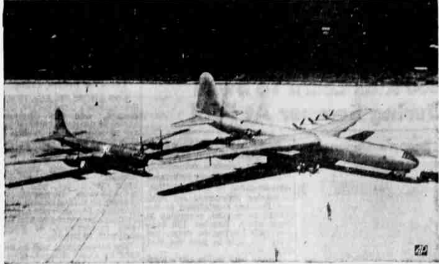
The army air force's huge experimental B-36 bomber (right) dwarfs a B-29 (left) as the two planes are parked near each other in this photo just released in Washington along with announcement the B-36 was airborne 38 minutes in its first flight test. The B-36 is powered by six 3000 horsepower engines and has an effective range of 10,000 miles.