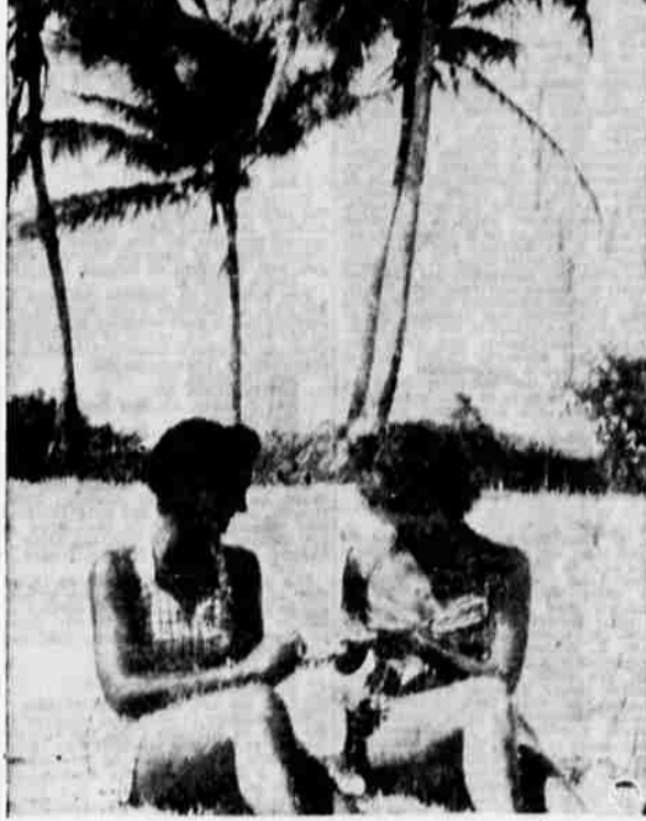
Assured that radio-activity is no longer present in the water of Bikini lagoon, hundreds of sailors, nurses and workers on Operation Crossroads swarmed onto the beautiful tropic beach. Here two pretty nurses from navy hospital ship Benevolence, take a sunbath, framed by waving palms. Photo by Andy Lopez, NEA-Acme photographer. Joint army-navy task force one radio-telephoto. —NEA radio-telephoto.