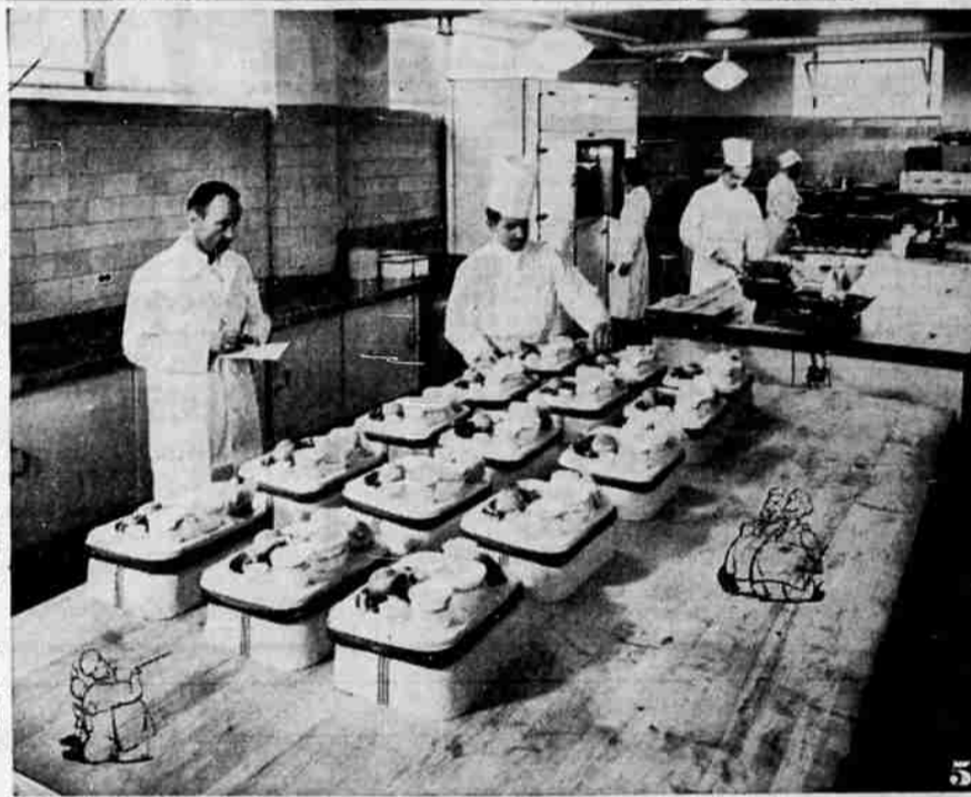
APPETITES FLY, TOO! —One of the big jobs of United Air Lines is that of serving full-course meals, including hot dishes, to hungry passengers. The company maintains 10 flight kitchens across the nation. Here the chef is passing approval on individual trays which have been prepared for an incoming Mainliner.