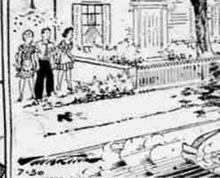
"Well, I gotta keep an appointment! See you later!"