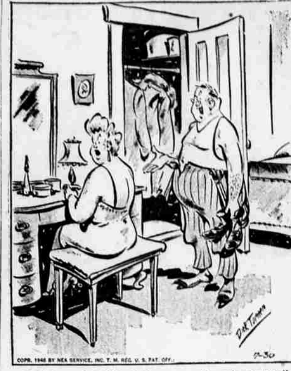
"I think people LIKE a little exaggeration when you tell a story! Don't you just eat it up when I call you 'Darling' and 'Precious' and stuff?"