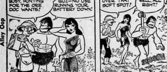
"Watch it, Ooola! Better let me help you over that soft spot!"

WELL, I GOTTA KEEP AN APPOINTMENT! SEE YOU LATER!