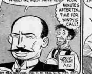
"I'm sorry now tell us why your daughter and Mr. Tubbs drove away yesterday—get the phone please, Dr. Schizy!"