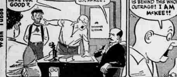
"We had no time to investigate your case yet, but your friend Mr. Waddy tells us you are a rancher, and not the tycoon J.R. McKee!"

JUST WHAT DO YOU MEAN ABOUT ME BEING HERE FOR GOOD?