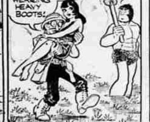
"Well, I'll be...?"