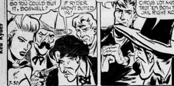
"Yeah, and I'd-a done it if Ryder hadn't suited in."

YOU ADMIT TRYING TO WRECK MY SHOW SO YOU COULD BUY IT, BOSWELL?