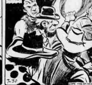
"I'll pick up Roswell's pal, Pugh, at the circus lot and trot 'em both to jail right now!"