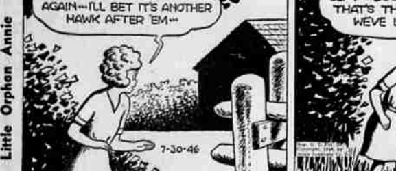
"Yessir—just a few feathers left—dog gone those hawks! That's the third chicken we've lost today."

HEY! CHICKENS SQUAWKING AGAIN—ILL BET IT'S ANOTHER HAWK AFTER 'EM—