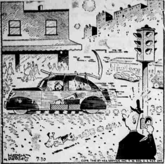
"We've been on vacation quite a while and may have a little trouble getting to the front door!"