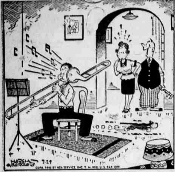
"I finally fixed it so Junior won't play loud enough to annoy the neighbors!"