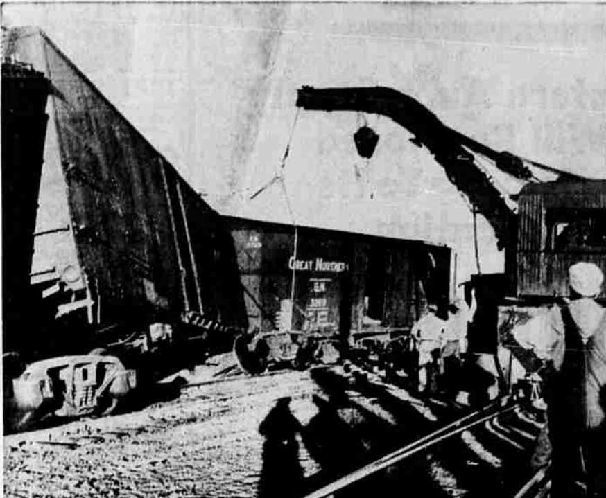
Rolling down a slight grade near the GN roundhouse yesterday afternoon, a refrigerator car knocked two empty boxcars off the track and itself turned over. A relief tender and yard crew went to work immediately clearing the track and in a few hours had lifted all three cars back to the rails.