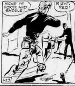
Boots and Her Buddie