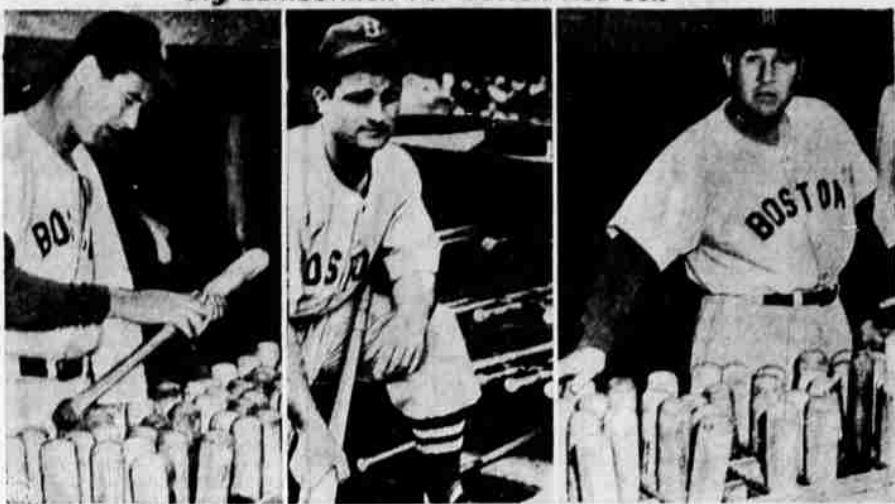
These three gentlemen are the big guns of the Boston Red Sox who now are out in front of the American league by eight full games over the New York Yankees. On the left is Ted Williams, batting .348; leading in home runs with 23, and having batted in 73 allies. Center shot is of Bobby Doerr, who has chased in 73 runs and is hitting .306. Rudy York, on the right, follows Williams and Doerr in the RBI department.