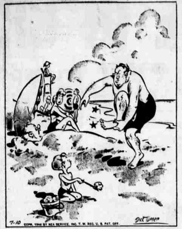
"What do you mean, you didn't see me? Did you think this was just an old head someone left lying here?"