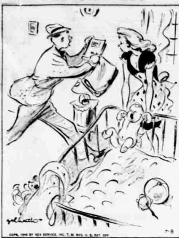
"I bought this up-to-the-minute book on juvenile delinquency—it worries me how stubborn and hard-boiled he is demanding his bottle!"