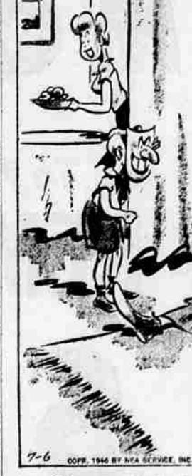
"If you see Junior, humor him—act frightened!"