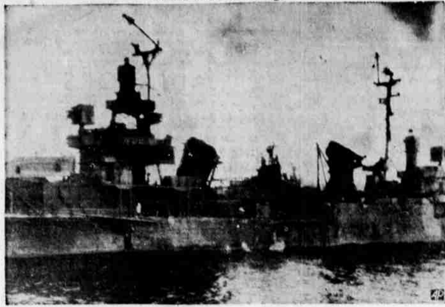
The heavy cruiser USS Pensacola with her superstructure damaged is shown in Bikini lagoon after the atomic bomb blast. Photograph made from the salvage ship Reclaimer. This joint army-navy task force 1 photo was radioed to San Francisco from the USS Mt. McKinley.