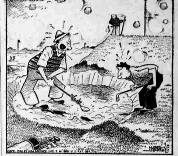
"It's a tablespoon—I always have trouble getting out of sandtraps!"