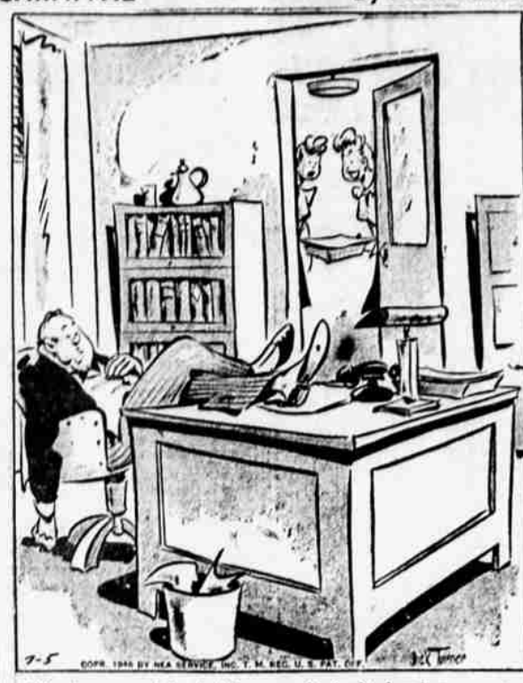
"Business must be looking up—he isn't sleeping as restlessly as he used to!"