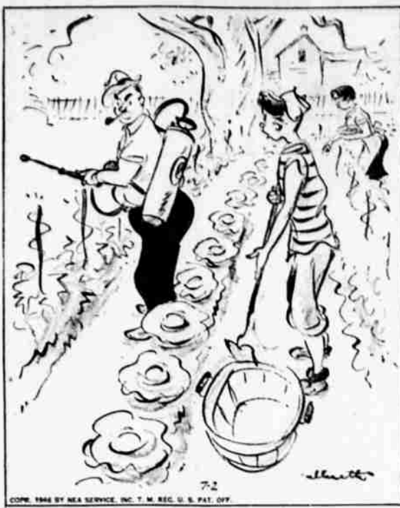
"If it isn't a bug it's a worm, and if it isn't a worm it's a weed, and after all is said and done, what have you got? Cabbage!"