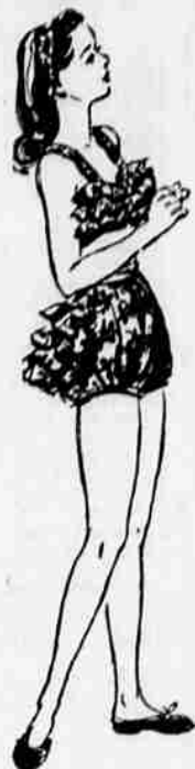
BLOOMER STYLE SUN SUIT

A fluffy light-weight bloomer and bra suit in colorful prints. Drawing type bloomers. Fine cotton crepe. 12 to 18.