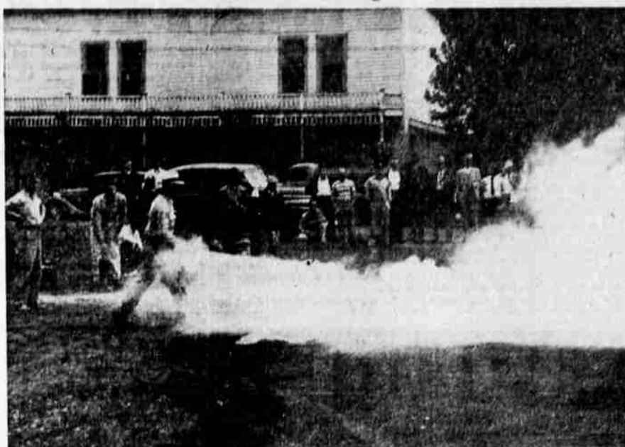
Dugas, a chemical used to put out gasoline and oil fires, was demonstrated by the fire department, which plans to install the extinguisher.